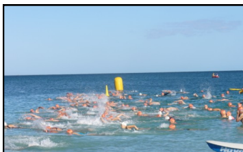
COOGEE JETTY TO JETTY A perfect introduction to open water swimming